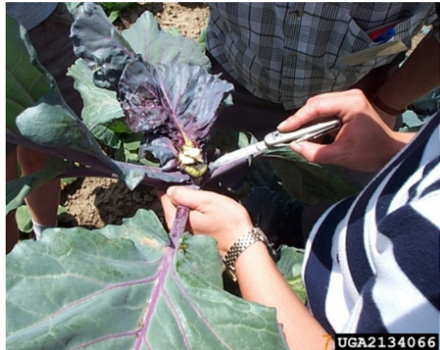
Daim duab 5. Cov nplooj zaub caws thiab loj dhau ntawm hom zaub qhvw liab