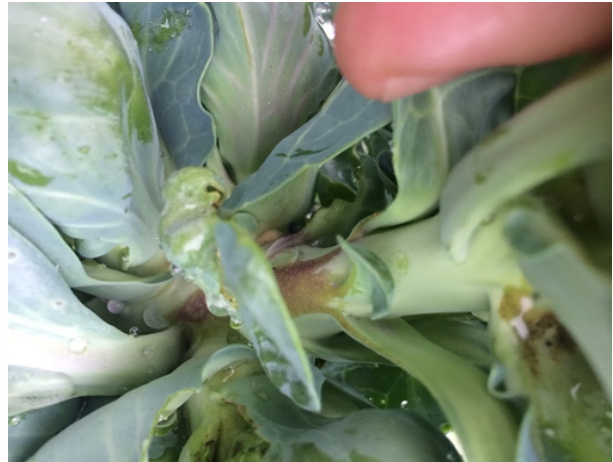
Daim duab 4. Tus kav zaub ntawm hom zaub Brussel sprout caws (MN Dept. of Ag.)

Tus kab/yoov Swede midge yog tsev kab ntawm gall-making family Cecidomyiidae, es thaum lawv noj cov qoob loo ces ua rau cov qoob loo caws thiab tsis zoo nkauj lawm. Qhov kev puas tsuaj tsim ntawm cov kab no ua rau cov nplooj ntoo caws thiab to, ua rau tsoob zaub loj tsis taus. Tej zaum kuj muaj kev puas tsuaj xws li ua rau cov zaub tsis muaj tej yam zoo rau tib neeg lub cev xws li nutrient thiab siv tshuaj tua ntau ces yuav ua rau cov zaub loj tsis tau zoo; yog li no, thaum muaj cov kab no yuav tsum nrhiav kom tau es thiaj li paub tseeb tias yog hom kab no tiag.