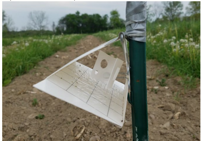
Daim duab 6. Jackson trap tswj cov kab swede midge es ya tau (Cornell Extension)

Txawm tias yeej muaj cov khoom es cuab thiab tswj kom tau cov kab midge es loj txaus (cov txiv), cov kab no kuj yog ib hom kab es nrhiav pom nyuaj heev, thiab cov kab/yoov es laus lawm kuj nteg qe, daug ua kas es twb ua rau qoob loo puas tsuaj ua ntej yuav ntes tau lawv. Cov neeg tshawb fawb hauv Cornell qhia kom siv daim cuab es yog xim dawb hu ua white Jackson trap (Scentry Biological Inc., Billings, MT), es nws yog daim ntawv nplaum xim dawb es muaj ib co kua tsw hu ua pheromone kom cov kab no nyiam es thiaj ya los tsaws rau. Tej daim ntawv nplaum no yuav tsum tau muab cuab kom qis ze rau hauv av thiab mus saib txhua txhua lub asthiv. Cov kev tshawb fawb yav tag los hauv NY thiab Canada tshawb pom tias yog ntes tau 5 tug yoov ces qhov no qhia tau tias twb yeej nteg qe thiab daug ua kas ua rau qoob loo puas tsuaj lawm. Yog hais tias cuab tau yoov ntawm daim ntawv nplaum no ces kav tsij nrhiav txoj hauv kev tiv thaiv kom tsis txhob muaj cov kab no coob coob. Ntxiv mus thiab hais txog tswj cov kab no thaum ua yoov lawm, yuav tsum tau soj ntsuam xyuas cov qoob loo kom pom cov qoob loo es puas tsuaj. Mus ncig saib ntawm tej ntug teb thiab saib seb cov nplooj zaub puas caws, to qhov, los yog loj tsis taus (Daim duab 3-5).