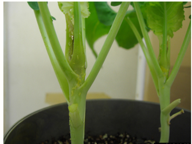
Daim duab 2. Tus kab Swede midge larvae nyob ntawm tus kav zaub cauliflower.

Tus kab/yoov Swede midge thaum loj txaus lawm ces yog xim suab thaj dawb zem zuag, ntev li ntawm 2 mm, thiab twb yuav luag ntsia tsis pom qhov txawv ntawm lwm cov kab midge tshwj tsis yog tias muab los tsom ntawm lub iav saib tej yam khoom me me.