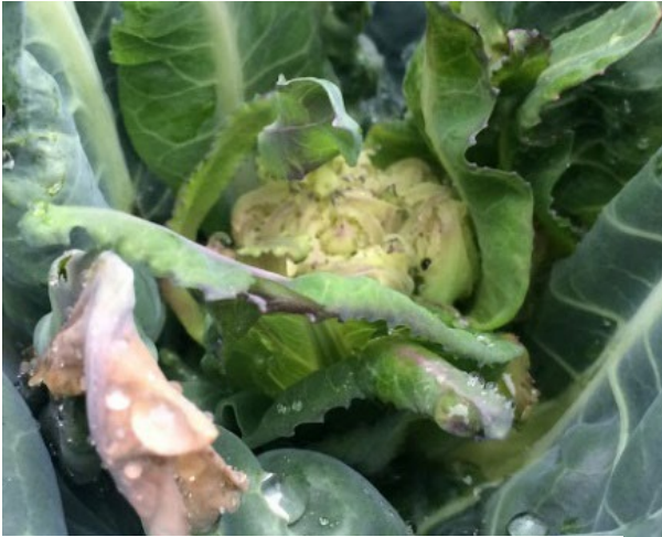
Daim duab 6. Lub paj zaub qhvv dawb Cauliflower “tsis loj hlob” vim cov kas muab noj. Lub taub hau zaub qhvv yeej yuav tsis loj tuaj li.

tsum tau siv tshuaj tua cov yub thiab txuag rau cov av ua ntej yuav cog cov yub zaub no.