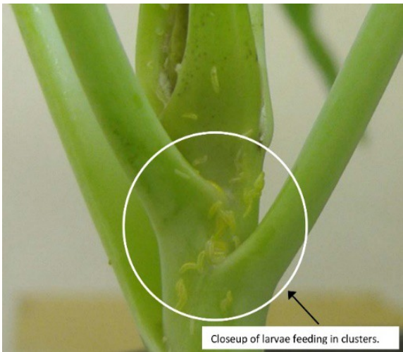
Closeup of larvae feeding in clusters.

Cov kas mas kheej li lub raj xyooob thiab pom tshab plaws thaum tseem yau, ces nws hloov mus rau xim daj plhes thaum loj txog ntu kawg, thiab lawv ntev li ntawm 3-4 mm. Thaum lawv tseem yog tus kas mam lawv noj ua ib ke ib pawg txog ntua thaum lawv loj txog ntua qib kawg, qib es lawm poob ntawm tsoob ntoo los mus hauv av es mus nkaum hauv ib lub plhaub. Nyob hauv lub lav Michigan, muaj ntau npaum li peb-tsib phaum kab thaum lub Tsib hlis ntuj mus txog lub Kaum hli ntuj.